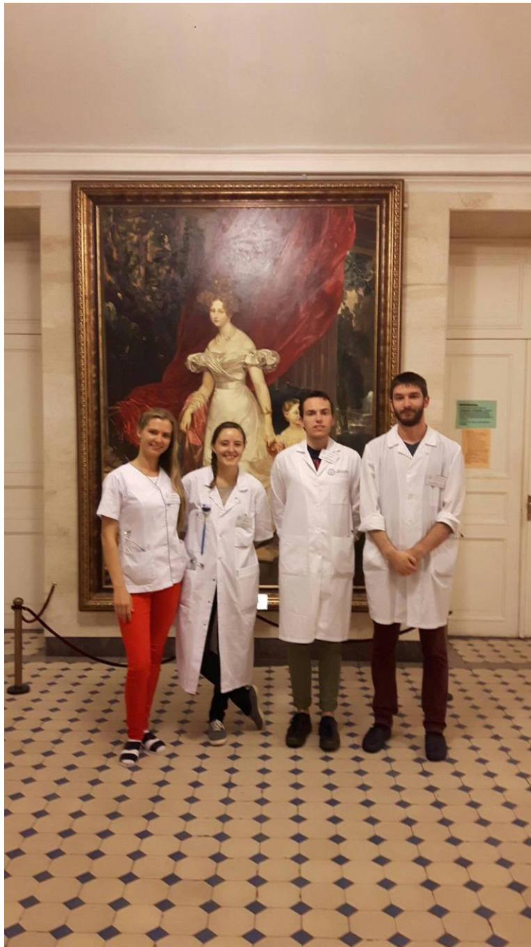
Photo about the exchange students, who were at Department of Cardiovascular Chirurgic at the hall of the clinic.

I had the possibility to visit more departments. I was also allowed to visit the surgical theatre. The whole staff, the doctors, the nurses were really kind. They really took care of us, they translated us the conversations, the anamneses. They explained us everything, we shall understand. I felt involved, they invited us to consultations, they offered us the possibility of watching procedures. They were so nice, wanted to show us as much as they could. They also let us do physical examination of patients. They did an excellent job. I think I learnt much during this practise. I should be very grateful for them, I would like to say thank you to the staff of the clinic, especially to our tutors.